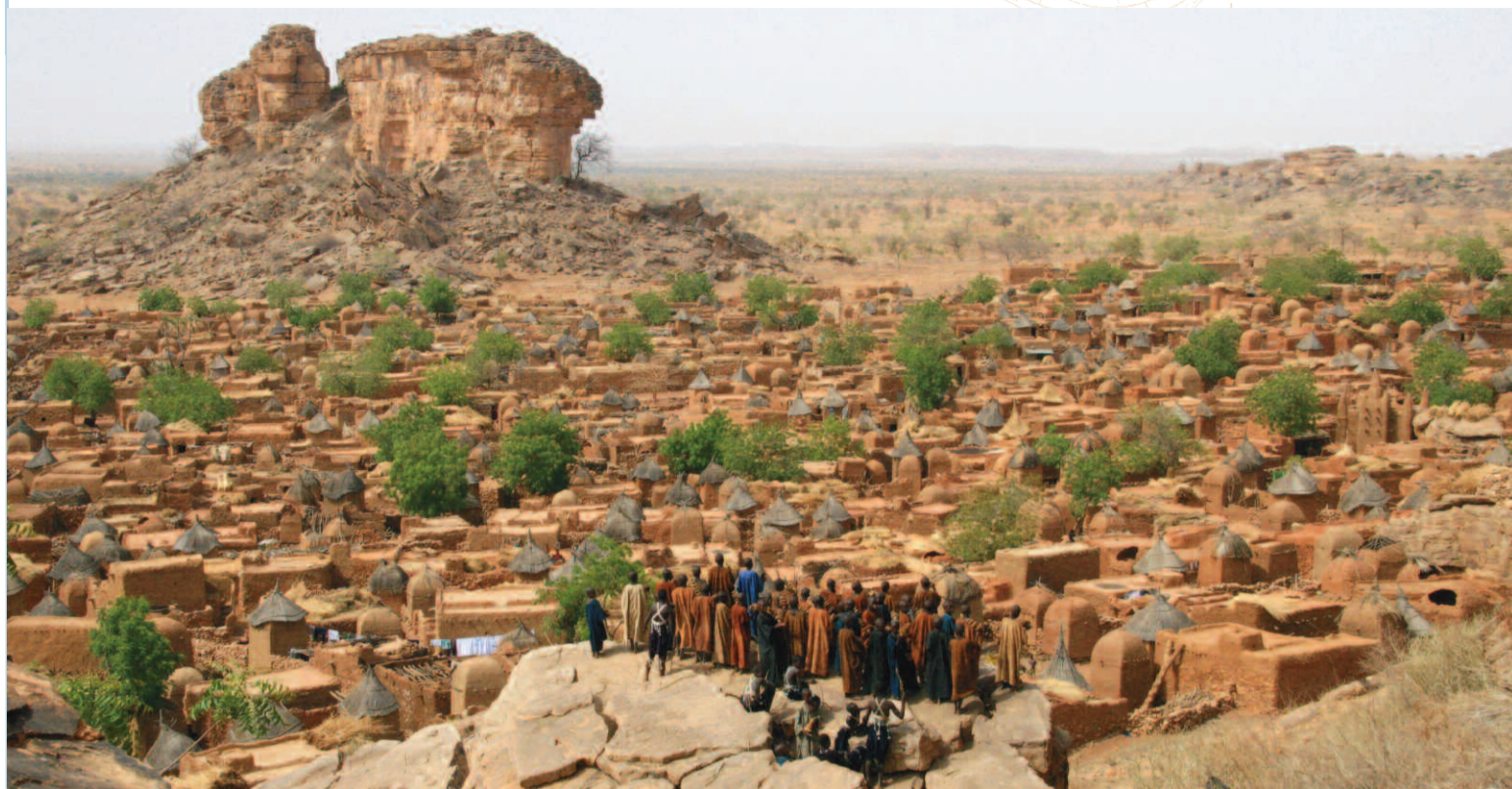
Plaine de Songo - Mali